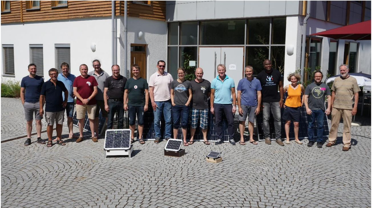
The VET4Africa team

The goal of the German trainers in vocational schools is to support African colleagues in the topic of photovoltaics and renewable energies and to show how modern technology can make the energy of the sun usable for everyone. With the help of new media, the contents can be used for training purposes on site and the knowledge is passed on via the multipliers.